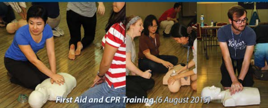
First Aid and CPR Training (6 August 2015)