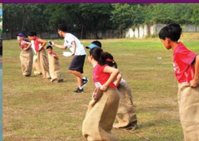
Independence Day Celebration (20 August 2015)