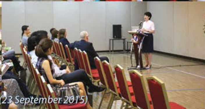
Open House (23 September 2015)