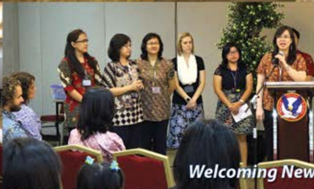
Welcoming New Family (7 August 2015)