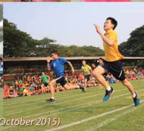
Senior School Athletics Day (6 October 2015)