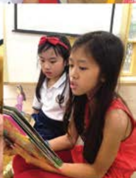
Buddy Reading (23 September 2015)