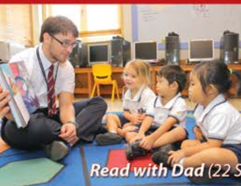
Read with Dad (22 September 2015)