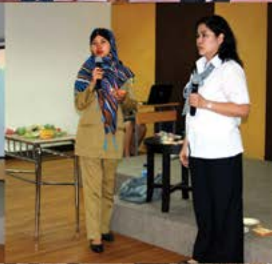
Junior School Healthy Week (15 September 2015)