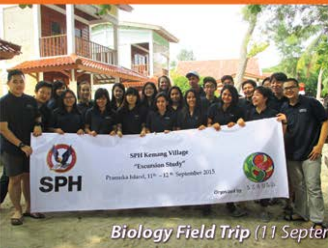
Biology Field Trip (11 September 2015)