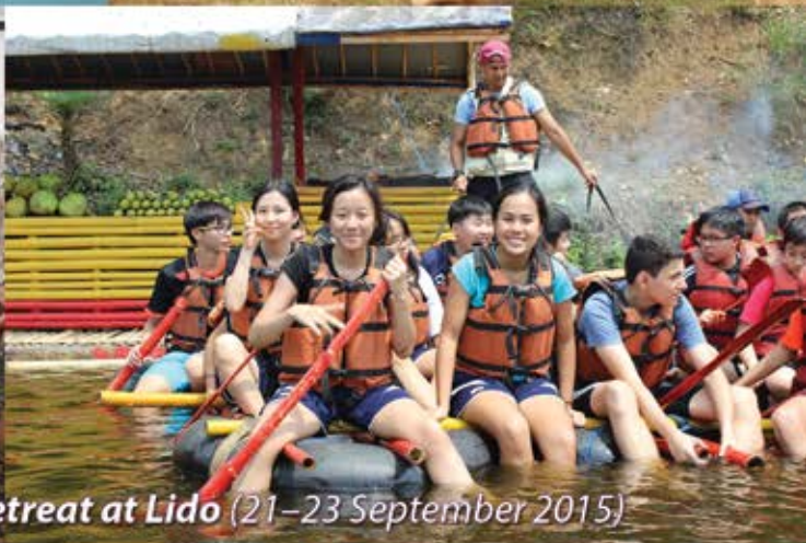
Senior School Retreat at Lido (21-23 September 2015)