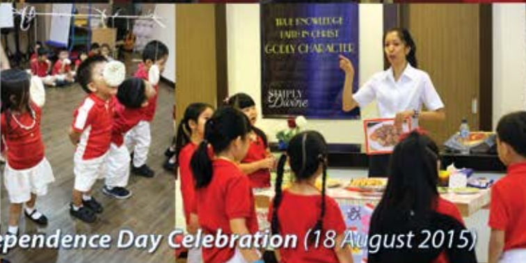
Independence Day Celebration (18 August 2015)