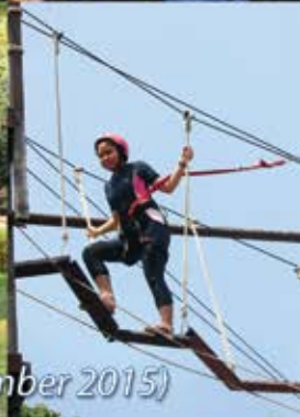
PHH Goes to WaterBoom, Cikarang (24 September 2015)