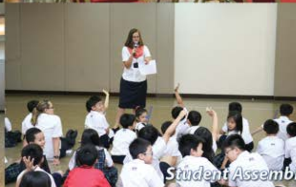
Student Assembly (29 September 2015)