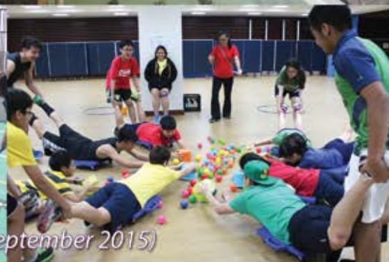
Sports Day (17-18 September 2015)