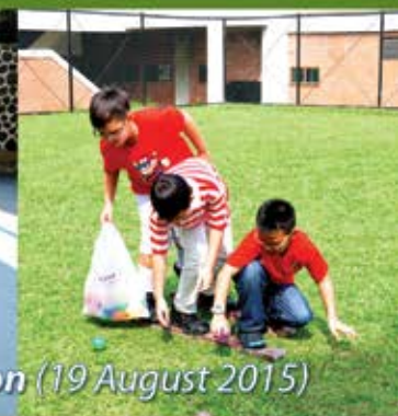
Independence Day Celebration (19 August 2015)