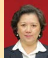
By Soekarmini Parenting Center – SPH Lippo Village

Do parents act consistently when they are tired and frustrated or when they are busy doing other things? Are consequences applied only when their mood is gloomy and depressed?